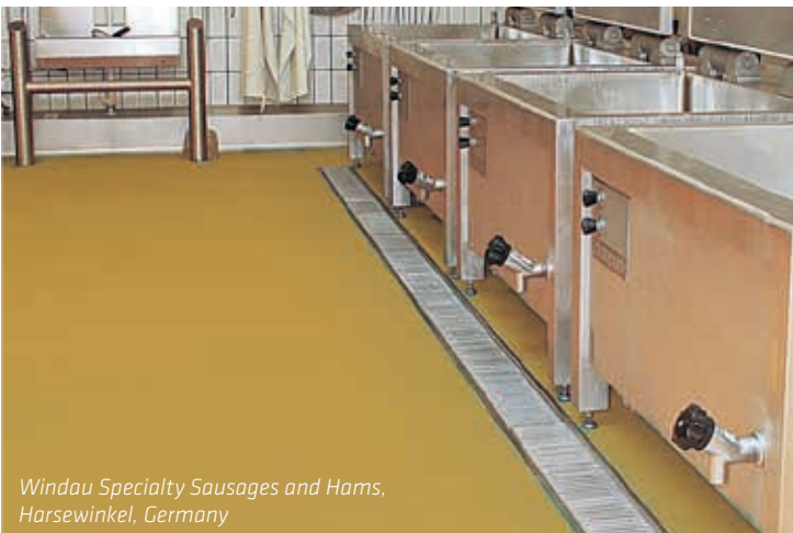
Windau Specialty Sausages and Hams, Harsewinkel, Germany