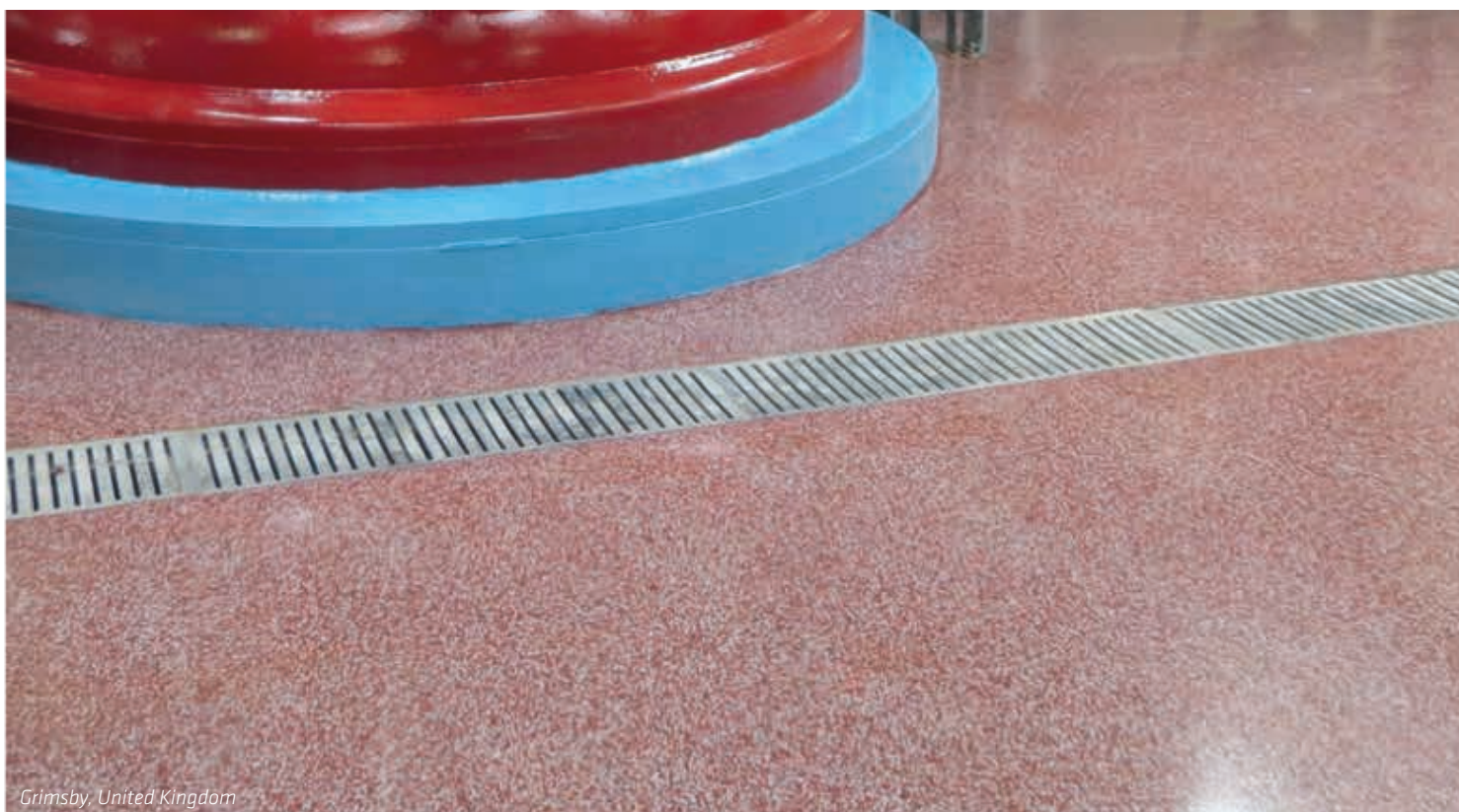
Grimsby, United Kingdom