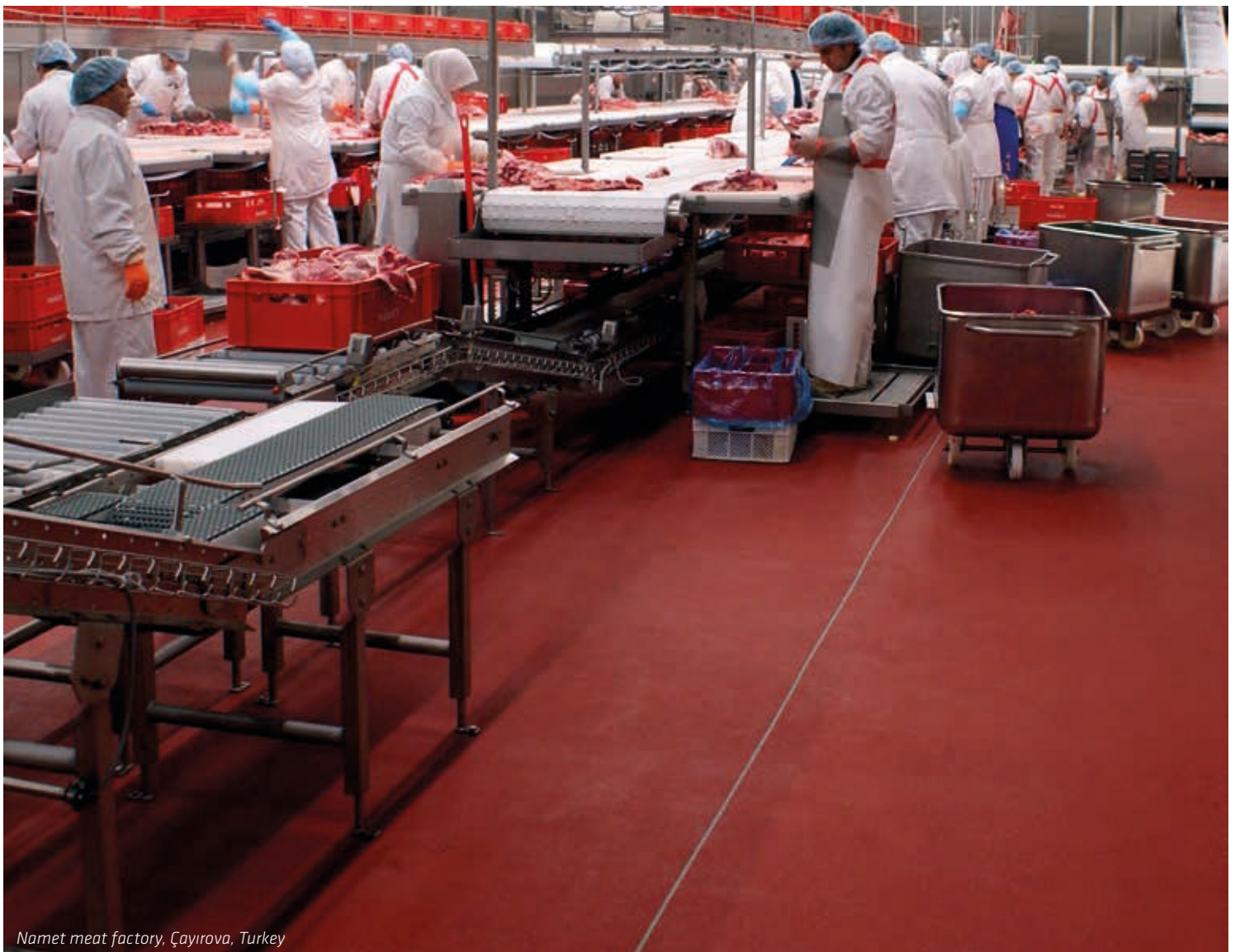
Namet meat factory, Çayırova, Turkey

On refurbishment projects, the flooring contractor should be experienced with working within a food industry environment. It is important that the routes of access to the work area and facilities, the location of the mixing station and the areas for storage of materials and waste are agreed and adhered to, so that contamination of adjacent production areas can be avoided.