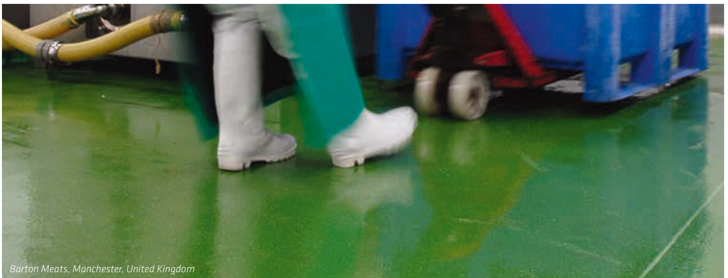
Barton Meats, Manchester, United Kingdom

The correct level of slip resistance, for any given area will depend upon activities taking place. BRG 181 5 gives specific guidance.